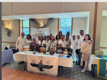
Cyrus the Great Exhibit at the Washington Hebrew Congregation, Embassy Row, Washington DC on 8 Sep. 2024, with members from the Zoroastrian Association of Metropolitan Washington Inc .