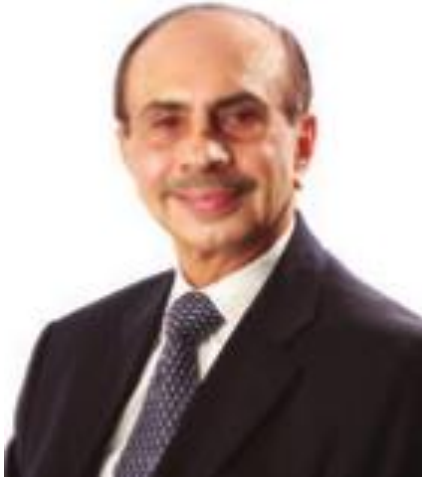
Adi Burjorji Godrej