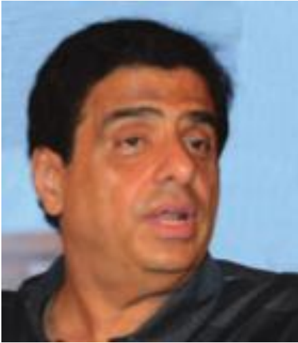
Rohinton Soli (Ronnie) Screwvala