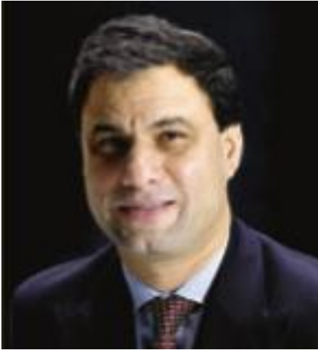
Baron Karan Bilimoria