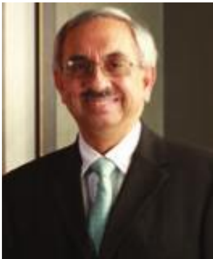
Nadir Burjorji Godrej

Adi Godrej is a veteran industrialist. He believes that generating jobs and producing common wealth is the greatest service to his country. A strong advocate of the free market economy and also deeply involved in environmental conservation, he has contributed tangibly to both. With a consumer-centric business philosophy, his cherished goal is to touch lives for the better. He has been the President of several Indian Trade and Industrial bodies and associations and was the President of Confederation of Indian Industry (CII) from 2012 - 2013 CE. He has been the recipient of several prestigious awards including the ' Padma Bhushan ' which was conferred upon him in 2012 CE by the Government of India, and the ' Golden Peacock Lifetime Achievement Award for ethical Leadership ' in 2016 CE, for being an outstanding Indian pioneer in the world of business and beyond.