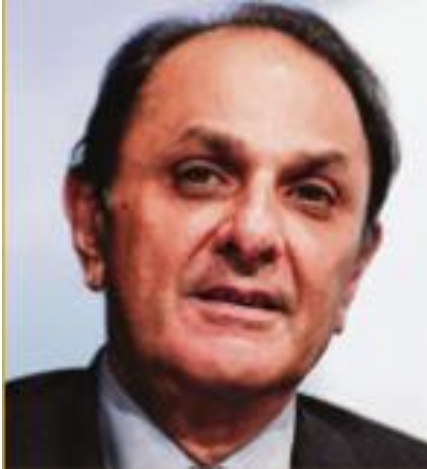
Nusli Neville Wadia