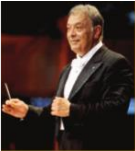
Maestro Zubin Mehli Mehta

Baron Karan Bilimoria is a fine example of how Zoroastrians not only flourish, but also contribute to society, no matter where they are in the world and whatever discipline they decide to follow. Baron Bilimoria is the Chairman of the Advisory Board, Cambridge Judge Business School; Founder and Chairman of Cobra Beer (now a joint-venture with the Molson Coors Brewing Company) and a Crossbench Life Peer in the House of Lords (appointed 2006 CE). A great Zoroastrian luminary, Lord Bilimoria has established the 'Cobra Foundation.' A few of the several awards conferred upon him are: The 'Commander of British Empire' (CBE) in 2004 CE; the 'Business Person of the Year' by the London Chamber of Commerce and Industry also in 2004 CE, and the 'Pravasi Bhartiya Samman' in 2008 CE by the President of India. Over the years Cobra Beer has won more than 70 awards from prestigious Monde Selection Awards.