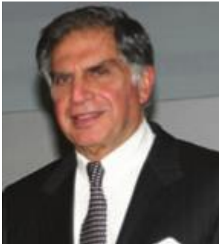
Ratan Naval Tata